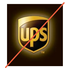
Do not add other effects to the brandmark.