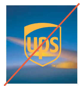
Do not place the one-color brandmark on a photograph or pattern.