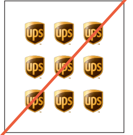
Do not use the brandmark as a motif or graphic design element.