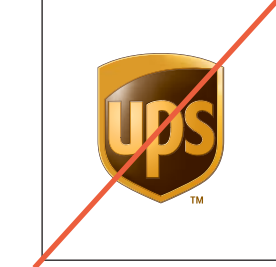
Do not change the brandmark's gradient direction.