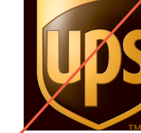
Do not crop the brandmark in any way.