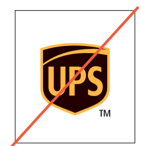
Do not redraw any element of the brandmark.