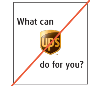
Do not create a "read-through" header with the brand mark.