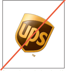
Do not change the brandmark's orientation.