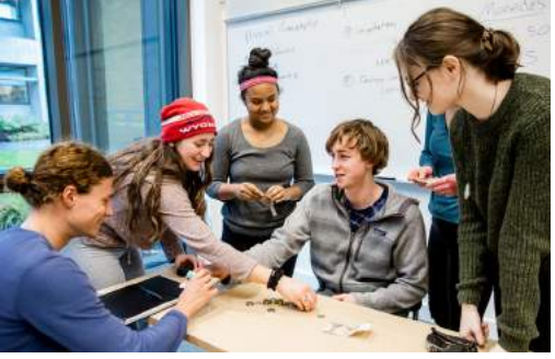
Show diverse students collaborating, with an equal field of focus