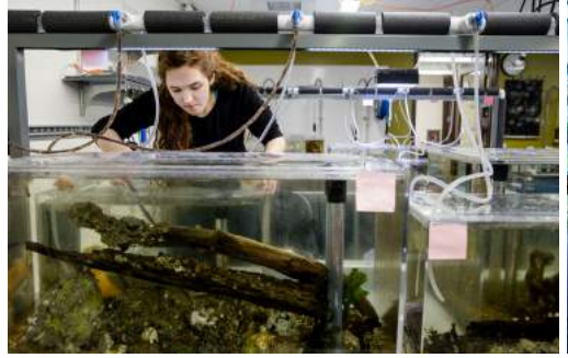
Show students at work