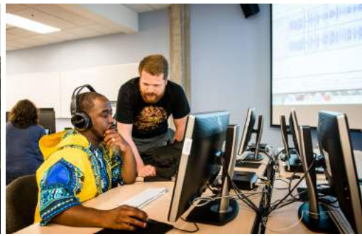
Capture teaching moments