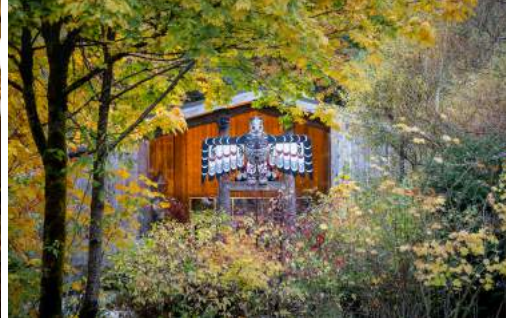
Showcase the beauty of the campus