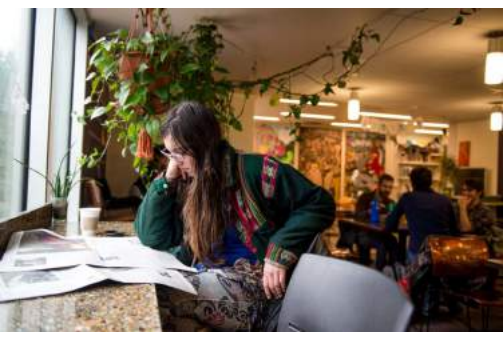
Capture intimate moments around campus