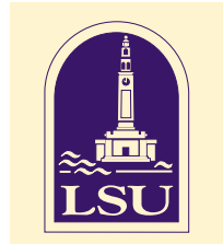
Overprinted on colored paper stock

This method of printing the logo on a solid color background without the contrast of the white elements is acceptable only when printing on a paper stock that is light enough to provide sufficient contrast for legibility.